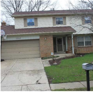
2040 Atterbury Avenue