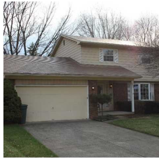
6396 Birkewood Street