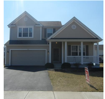
569 Evergreen Circle

Now is the perfect time to beat the Spring Flood of homes for sale in your neighborhood! With low interest rates and record numbers of buyers, WHAT ARE YOU WAITING FOR? Call Jan TODAY for a FREE market analysis of what your home could be worth on today's market.