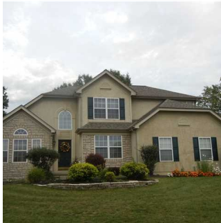
6396 Riker Drive